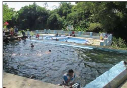
Fig. 2. Hydrotherapy Pool

In the beginning of the experiment, , the number of respondents were 25 males and 20 females. This fact is in line with Fortuna's study (2012) which stated that the number of males suffering from stroke are 51.35% while the number of females suffering from stroke are 48.65% [17] . Males suffering from stroke are liable to More serious risks because of the possibility of internal bleeding. Researches conducted in the USA, Great Britain, France, and Italy proves that the prevalence of stroke is more in men then in women [12] .