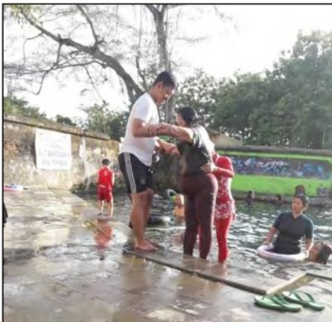
Fig. 4. Stroke Patient