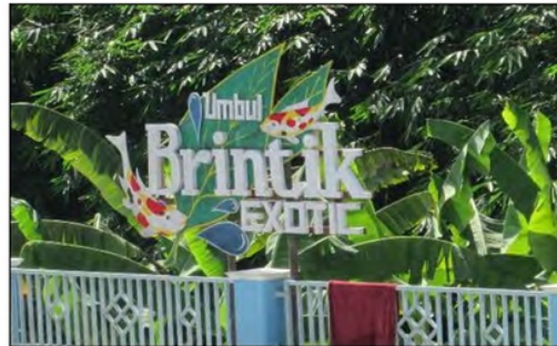
Fig. 1. Umbul Brintik, Central Java, Indonesia

comfortable wearing swimming outfit during the interview. The frequency of therapy depended on their availability. For example, the retired patients living nearby visted the pool every morning or every other day, those working visited the pool every week and people from neighbouring towns visited once a month.