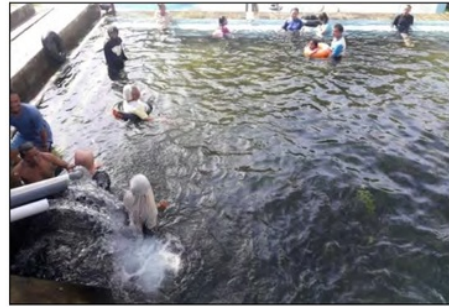
Fig. 6. Natural method implemented