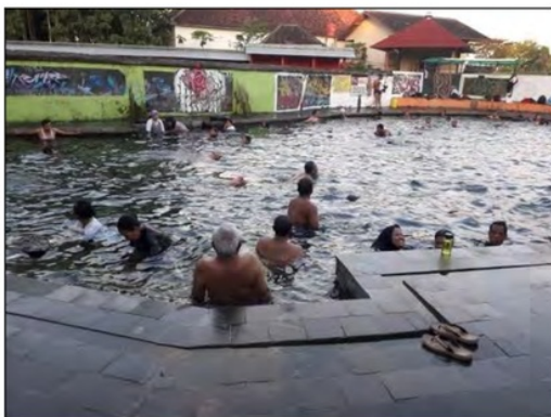
Fig. 5. Natural Swimming Method